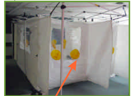
Protective arm sleeves