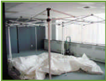
Quick erect shelter

Privacy cubicles where the public can be examined through protective windows using protective arm sleeves.