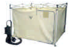
3. Attach and engage filter 4. Enter shelter

Nor E training programs available through the First Response Network