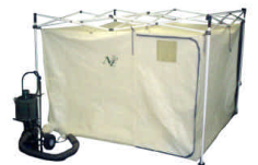
4. Enter shelter