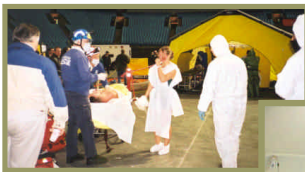
Various shelter sizes