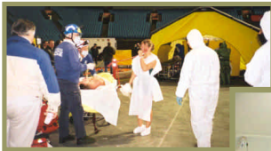
Various shelter sizes